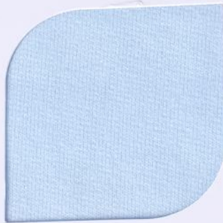
2# Light blue