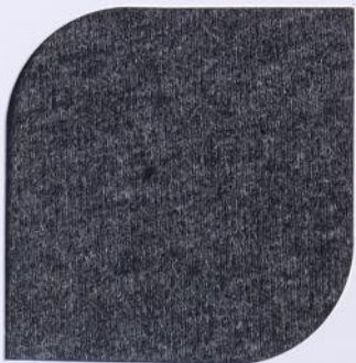
7# Charcoal grey