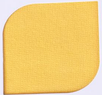
3# Bright yellow