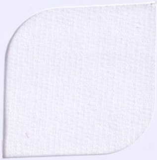
1# Off white