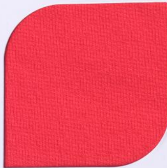
5# Chinese red