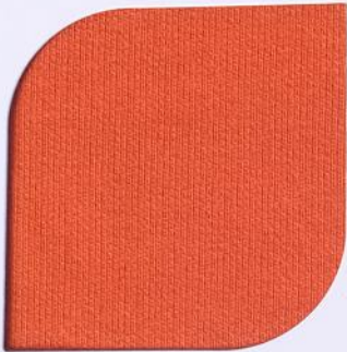
4# Rust red