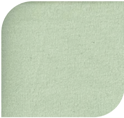
1# Pale aqua