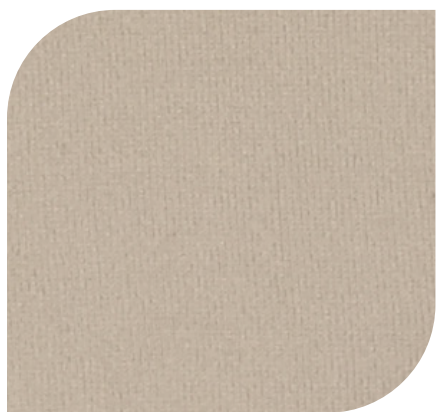
10# Dark khaki