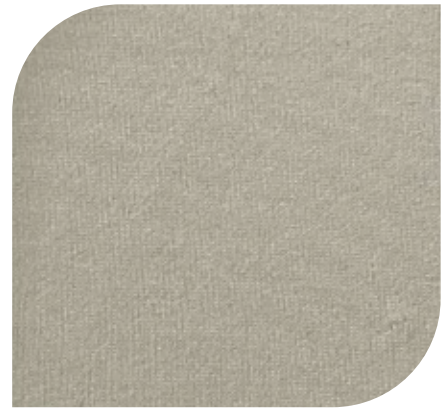
3# Ash grey