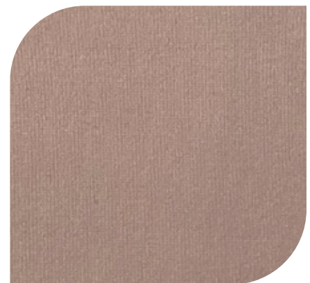
9# Dusky pink