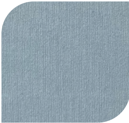
5# Pale blue