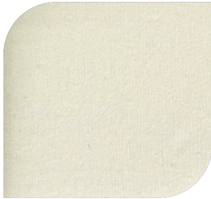
2# Off white